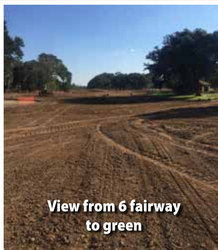
View from 6 fairway to green