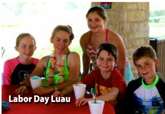
Labor Day Luau