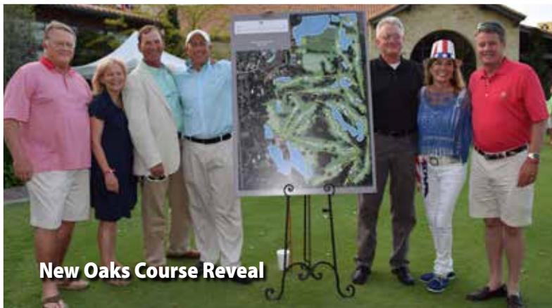
New Oaks Course Reveal