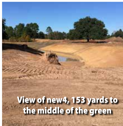
View of new 4, 153 yards to the middle of the green