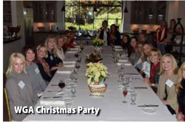
WGA Christmas Party