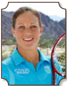
Liezel Huber Tennis Pro