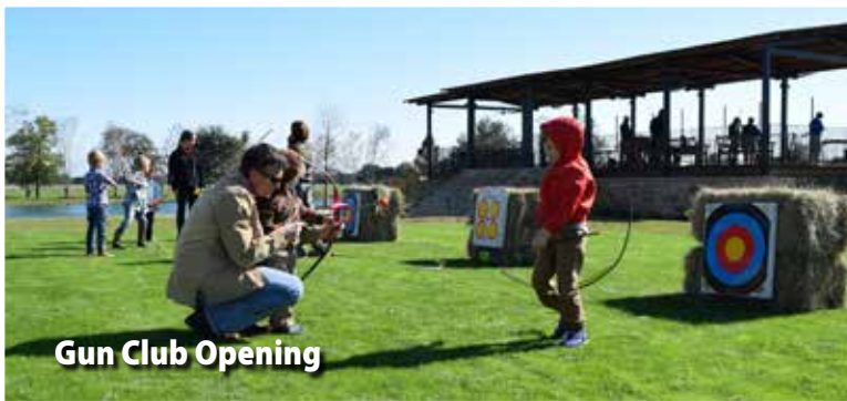
Gun Club Opening