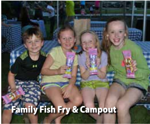
Family Fish Fry & Campout