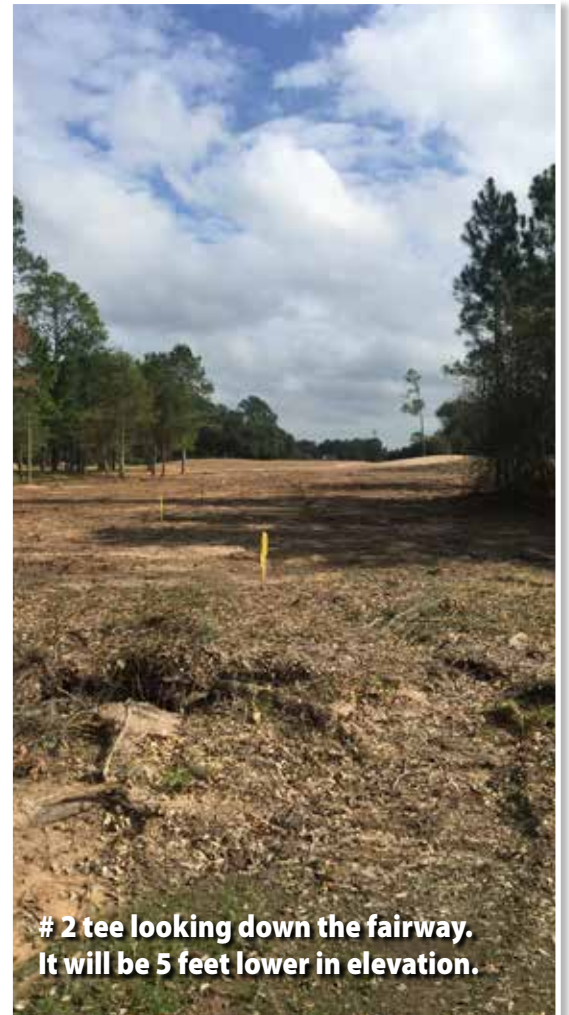
# 2 tee looking down the fairway. It will be 5 feet lower in elevation.

Something New we have planned for every Saturday is a "walk the course". Join us early for breakfast then we will leave at 9:30Am to walk the new course as it changes every week. Wear appropriate clothing, especially shoes you can get dirty. This can be a great time to get to know other HO members as well!