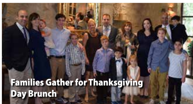
Families Gather for Thanksgiving Day Brunch