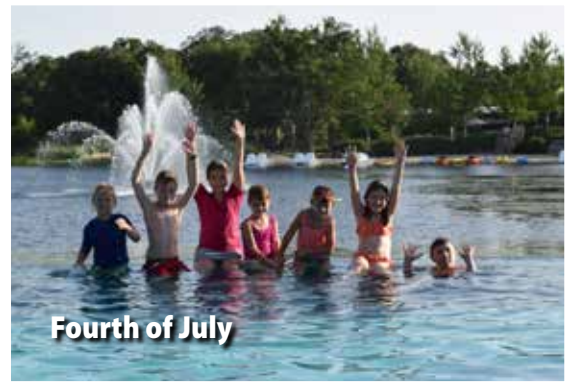
Fourth of July